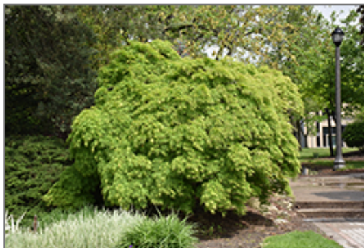
Cutleaf Japanese Maple