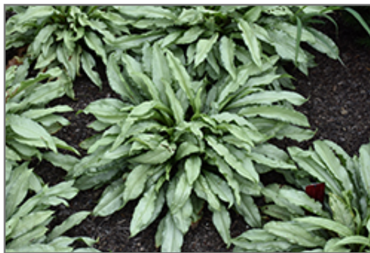
Diane Clare Lungwort