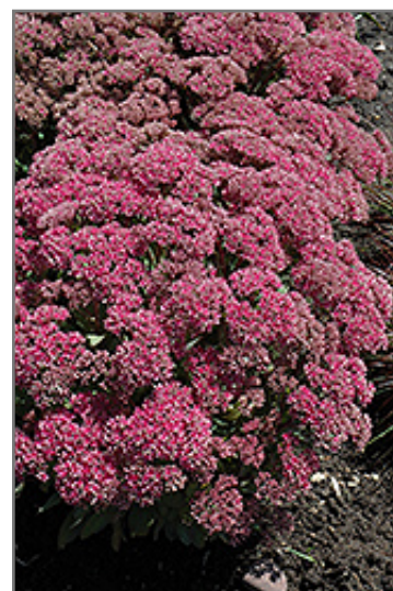
Mr. Goodbud Stonecrop flowers

Mr. Goodbud Stonecrop is recommended for the following landscape applications;