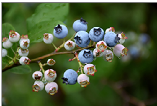
Highbush Blueberry fruit

This is a multi-stemmed deciduous shrub with an upright spreading habit of growth. Its average texture blends into the landscape, but can be balanced by one or two finer or coarser trees or shrubs for an effective composition. This is a relatively low maintenance plant, and usually looks its best without pruning, although it will tolerate pruning. It is a good choice for attracting birds to your yard. It has no significant negative characteristics.