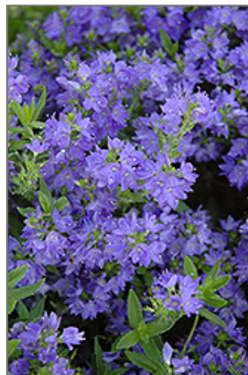
Trehane Creeping Speedwell flowers

Trehane Creeping Speedwell is recommended for the following landscape applications;