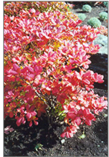
Royal Azalea in fall

This shrub does best in full sun to partial shade. You may want to keep it away from hot, dry locations that receive direct afternoon sun or which get reflected sunlight, such as against the south side of a white wall. It requires an evenly moist well-drained soil for optimal growth, but will die in standing water. It is not particular as to soil pH, but grows best in rich soils. It is somewhat tolerant of urban pollution, and will benefit from being planted in a relatively sheltered location. Consider applying a thick mulch around the root zone in winter to protect it in exposed locations or colder microclimates. This species is not originally from North America.