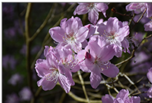
Royal Azalea flowers