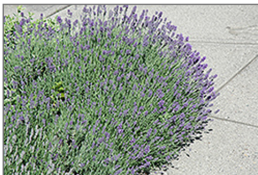
Munstead Lavender in bloom