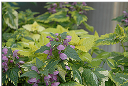
Anne Greenaway Spotted Dead Nettle flowers