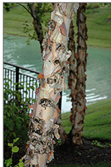
River Birch bark