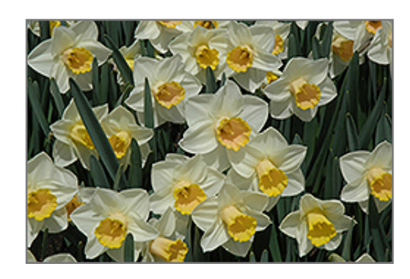
Salome Daffodil flowers