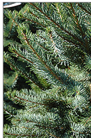
Bruns Spruce foliage