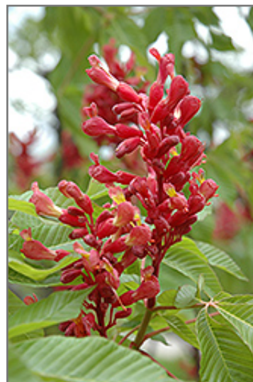
Red Buckeye flowers