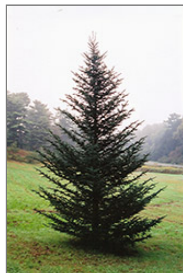
Fraser Fir

Fraser Fir will grow to be about 35 feet tall at maturity, with a spread of 20 feet. It has a low canopy, and should not be planted underneath power lines. It grows at a slow rate, and under ideal conditions can be expected to live for 70 years or more.