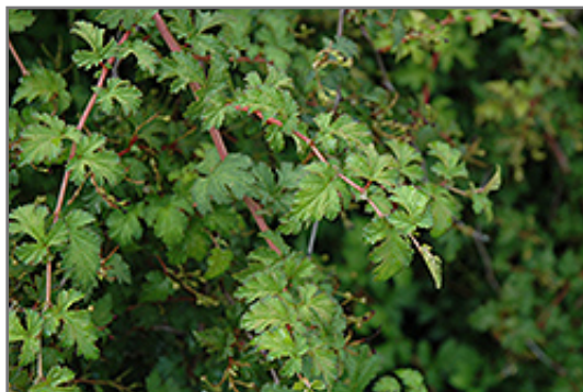
Cutleaf Stephanandra foliage