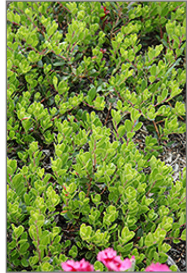
Bearberry foliage

This shrub does best in full sun to partial shade. It is very adaptable to both dry and moist growing conditions, but will not tolerate any standing water. It is considered to be drought-tolerant, and thus makes an ideal choice for a low-water garden or xeriscape application. It is very fussy about its soil conditions and must have sandy, acidic soils to ensure success, and is subject to chlorosis (yellowing) of the foliage in alkaline soils, and is able to handle environmental salt. It is somewhat tolerant of urban pollution. This species is native to parts of North America.