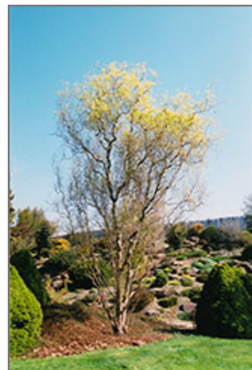
Dragon's Claw Willow in winter