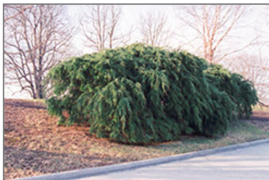
Sargent's Weeping Hemlock

Sargent's Weeping Hemlock is recommended for the following landscape applications;