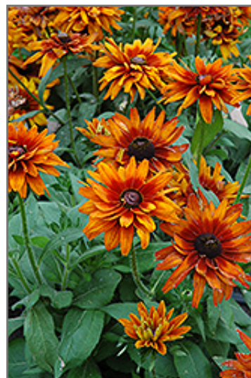
Cherokee Sunset Coneflower flowers