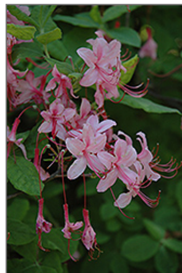
Pinxterbloom Azalea flowers