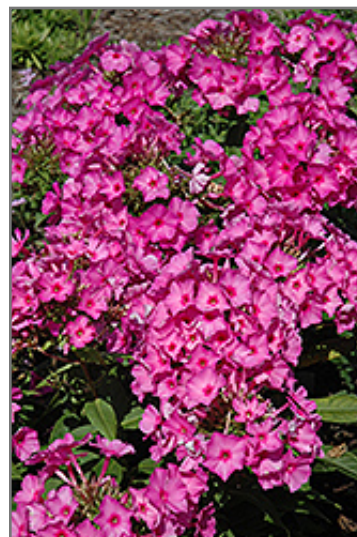
Flame Pink Garden Phlox flowers