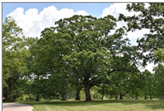
White Oak