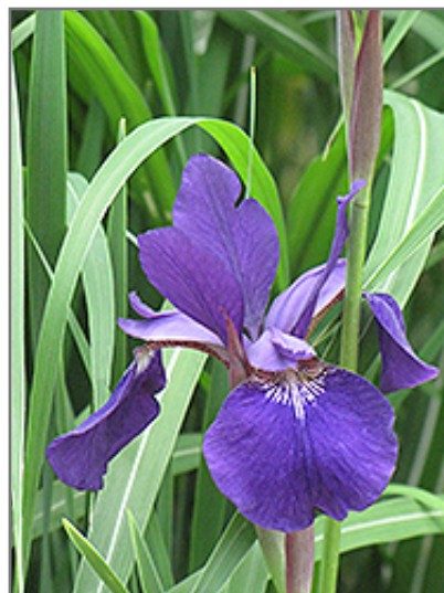
Caesar's Brother Siberian Iris flowers