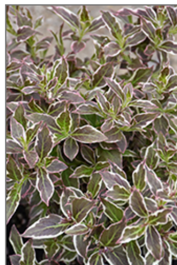
My Monet Purple Effect Weigela foliage