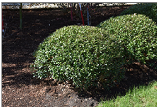
Strongbox Inkberry Holly