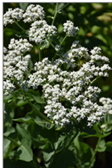
Wild Quinine flowers