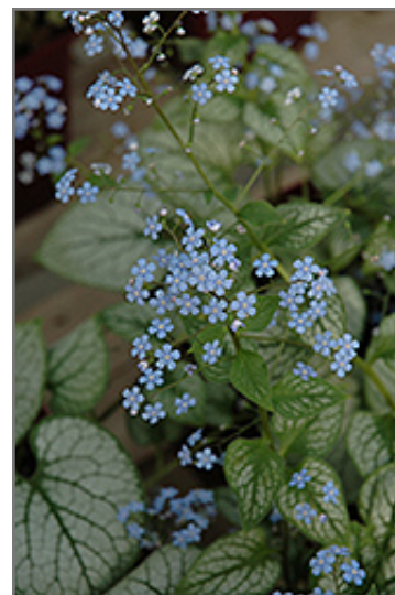
Jack Frost Bugloss flowers