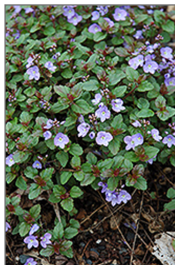
Waterperry Blue Speedwell in bloom