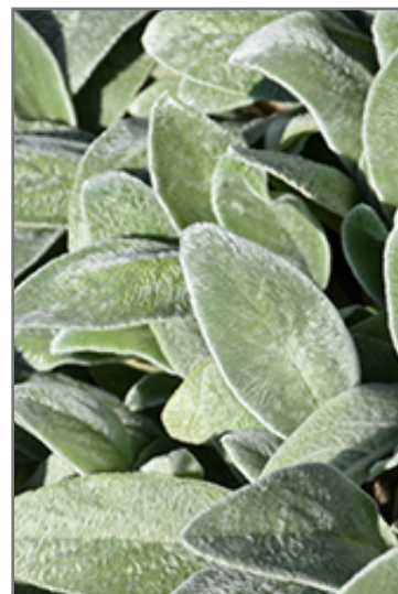
Lamb's Ears foliage

Lamb's Ears is recommended for the following landscape applications;