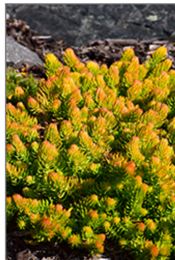
Angelina Stonecrop foliage