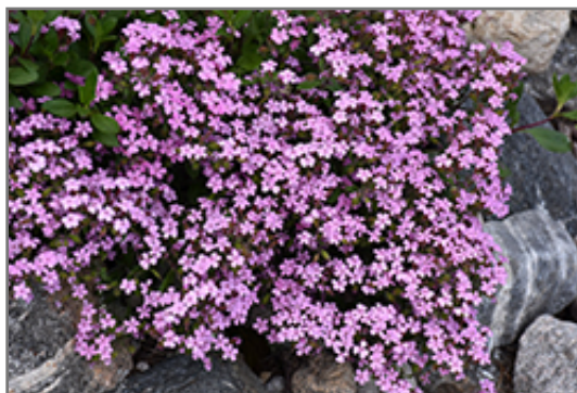
Rock Soapwort in bloom