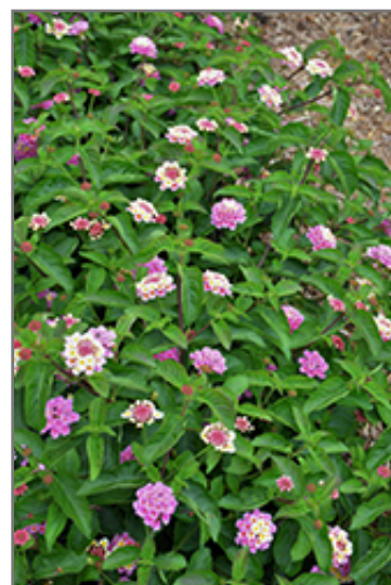
Landscape Bandana Pink Lantana in bloom