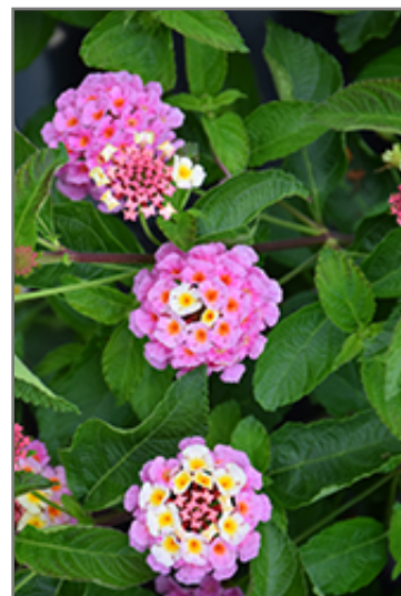
Landscape Bandana Pink Lantana flowers

Landscape Bandana Pink Lantana is recommended for the following landscape applications;