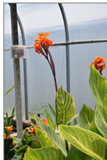
Bengal Tiger Canna flowers

This plant should only be grown in full sunlight. It requires an evenly moist well-drained soil for optimal growth, but will die in standing water. It is not particular as to soil pH, but grows best in rich soils. It is highly tolerant of urban pollution and will even thrive in inner city environments, and will benefit from being planted in a relatively sheltered location. Consider applying a thick mulch around the root zone in winter to protect it in exposed locations or colder microclimates. This particular variety is an interspecific hybrid. It can be propagated by division; however, as a cultivated variety, be aware that it may be subject to certain restrictions or prohibitions on propagation.