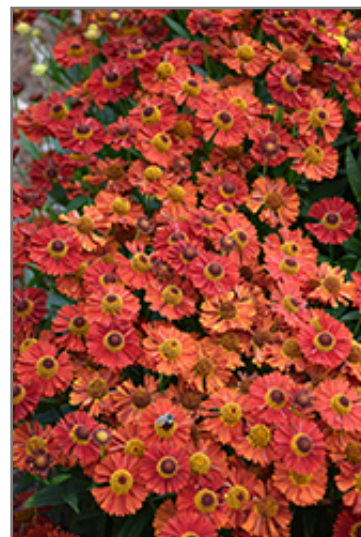
Mariachi Ranchera Sneezeweed flowers

Mariachi Ranchera Sneezeweed is an herbaceous perennial with an upright spreading habit of growth. Its medium texture blends into the garden, but can always be balanced by a couple of finer or coarser plants for an effective composition.