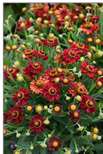
Mariachi Ranchera Sneezeweed flowers