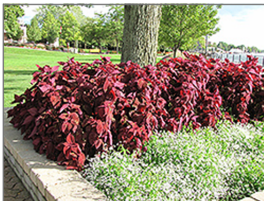
ColorBlaze Rediculous Coleus