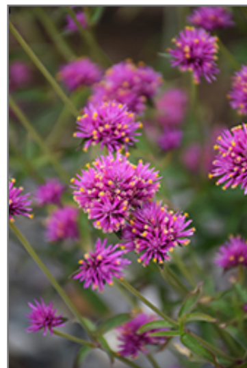
Truffula Pink Gomphrena flowers

This plant will require occasional maintenance and upkeep. Trim off the flower heads after they fade and die to encourage more blooms late into the season. It is a good choice for attracting bees and butterflies to your yard. It has no significant negative characteristics.