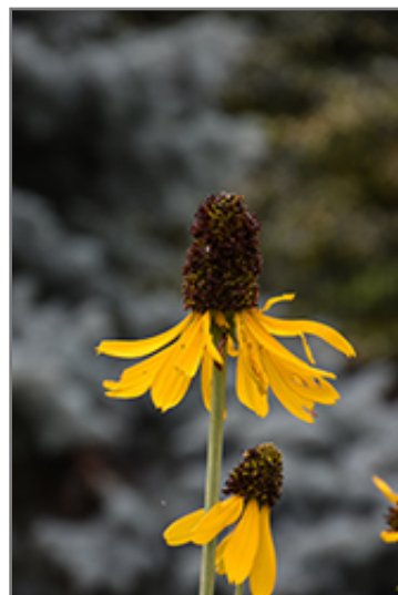
Giant Coneflower flowers

Giant Coneflower is a fine choice for the garden, but it is also a good selection for planting in outdoor pots and containers. With its upright habit of growth, it is best suited for use as a 'thriller' in the 'spiller-thriller-filler' container combination; plant it near the center of the pot, surrounded by smaller plants and those that spill over the edges. It is even sizeable enough that it can be grown alone in a suitable container. Note that when growing plants in outdoor containers and baskets, they may require more frequent waterings than they would in the yard or garden.