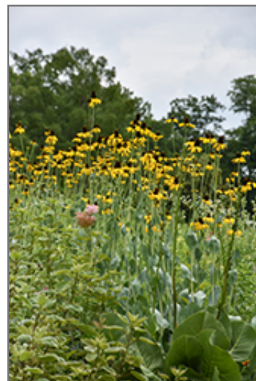
Giant Coneflower in bloom

Giant Coneflower is recommended for the following landscape applications;