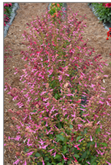
Skyscraper Pink Salvia in bloom

Skyscraper Pink Salvia is a fine choice for the garden, but it is also a good selection for planting in outdoor pots and containers. With its upright habit of growth, it is best suited for use as a 'thriller' in the 'spiller-thriller-filler' container combination; plant it near the center of the pot, surrounded by smaller plants and those that spill over the edges. Note that when growing plants in outdoor containers and baskets, they may require more frequent waterings than they would in the yard or garden.