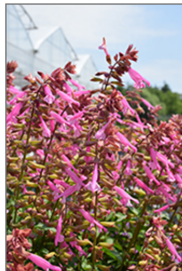
Skyscraper Pink Salvia flowers

Skyscraper Pink Salvia is an herbaceous annual with an upright spreading habit of growth. Its relatively fine texture sets it apart from other garden plants with less refined foliage.