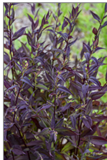
Lady In Black Calico Aster