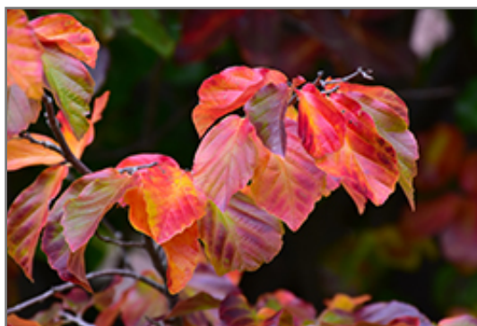
Persian Parrotia in fall