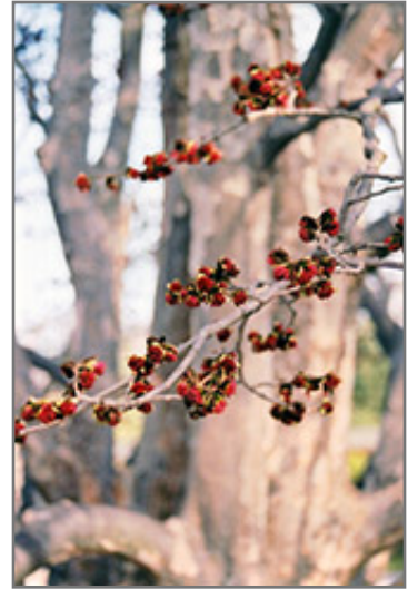
Persian Parrotia flowers

* This is a 'special order' plant - contact store for details