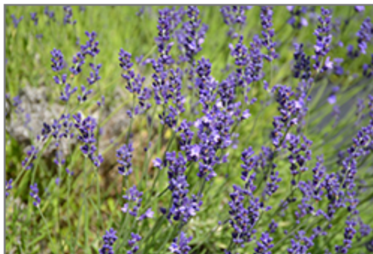
Provence Blue Lavender flowers