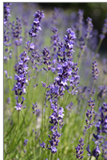
Provence Blue Lavender flowers

Provence Blue Lavender is a dense multi-stemmed evergreen shrub with a mounded form. It lends an extremely fine and delicate texture to the landscape composition which should be used to full effect.