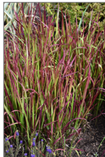
Red Baron Japanese Blood Grass foliage

Red Baron Japanese Blood Grass is recommended for the following landscape applications;