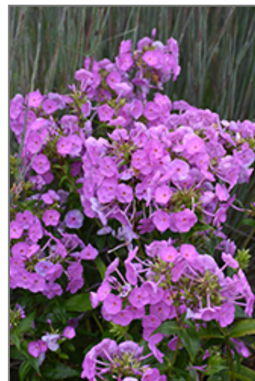
Fashionably Early Flamingo Garden Phlox flowers