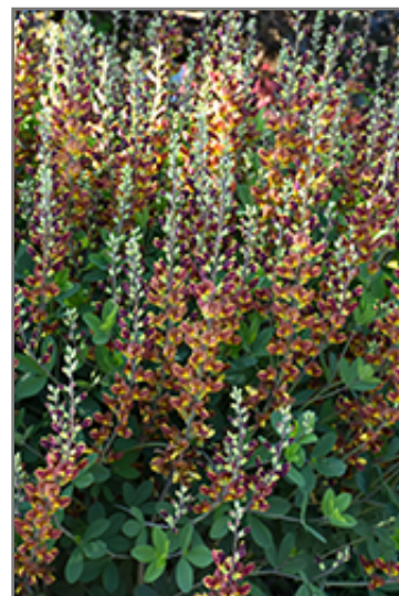
Decadence Cherries Jubilee False Indigo flowers

Decadence Cherries Jubilee False Indigo is a fine choice for the garden, but it is also a good selection for planting in outdoor pots and containers. With its upright habit of growth, it is best suited for use as a 'thriller' in the 'spiller-thriller-filler' container combination; plant it near the center of the pot, surrounded by smaller plants and those that spill over the edges. It is even sizeable enough that it can be grown alone in a suitable container. Note that when growing plants in outdoor containers and baskets, they may require more frequent waterings than they would in the yard or garden.