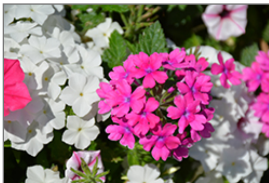
Superbena Pink Shades Verbena flowers

Superbena Pink Shades Verbena is recommended for the following landscape applications;