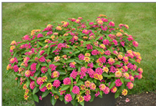
Luscious Royale Cosmo Lantana in bloom

Luscious Royale Cosmo Lantana will grow to be about 18 inches tall at maturity, with a spread of 24 inches. When grown in masses or used as a bedding plant, individual plants should be spaced approximately 18 inches apart. Although it's not a true annual, this fast-growing plant can be expected to behave as an annual in our climate if left outdoors over the winter, usually needing replacement the following year. As such, gardeners should take into consideration that it will perform differently than it would in its native habitat.