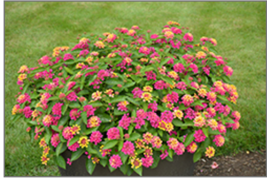
Luscious Royale Cosmo Lantana in bloom

Luscious Royale Cosmo Lantana will grow to be about 18 inches tall at maturity, with a spread of 24 inches. When grown in masses or used as a bedding plant, individual plants should be spaced approximately 18 inches apart. Although it's not a true annual, this fast-growing plant can be expected to behave as an annual in our climate if left outdoors over the winter, usually needing replacement the following year. As such, gardeners should take into consideration that it will perform differently than it would in its native habitat.