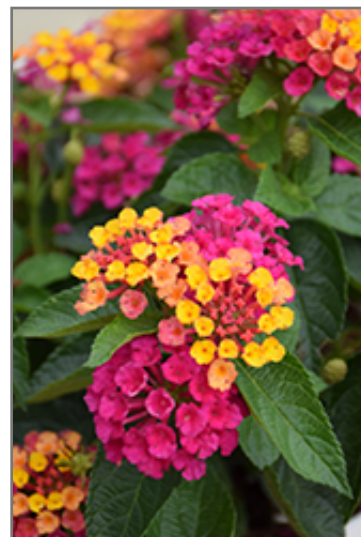
Luscious Royale Cosmo Lantana flowers

Luscious Royale Cosmo Lantana is recommended for the following landscape applications;