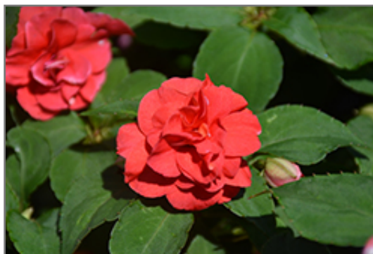
Rockapulco Red Impatiens flowers

Rockapulco Red Impatiens is recommended for the following landscape applications;