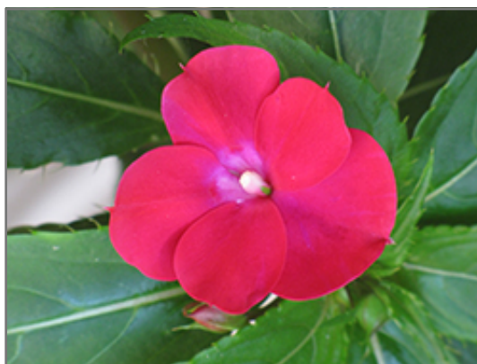
Infinity Cherry Red New Guinea Impatiens flowers