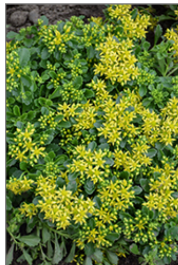
Little Miss Sunshine Stonecrop flowers

Little Miss Sunshine Stonecrop is recommended for the following landscape applications;