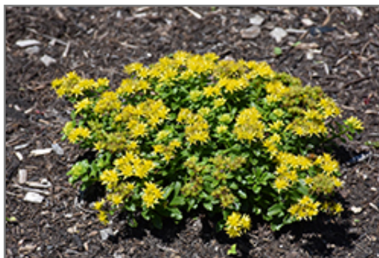
Little Miss Sunshine Stonecrop in bloom