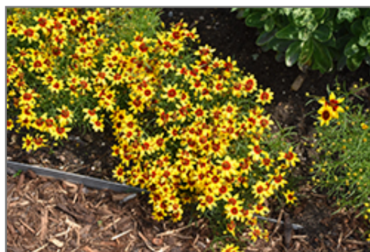
Sizzle And Spice Curry Up Tickseed in bloom