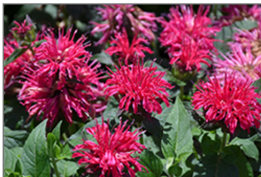
Balmy Rose Beebalm flowers